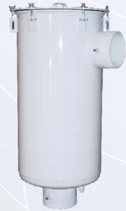
Single-Stage Oil Mist Eliminator Heavy Duty Discharge Eliminator Captures Oil Mist, Vapor & Smoke