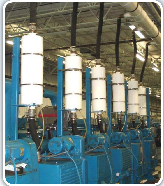
Edwards Vacuum Pump: Glass Coating Application Two-Stage Straight Through Discharge Oil Mist Eliminator