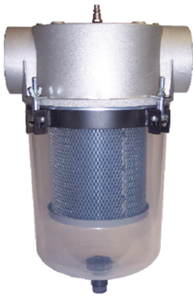
Reverse Pulse Vacuum Filter See-Through Housing with Self-Cleaning Reverse Pulse Technology