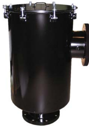
Heavy Duty Inlet Vacuum Filter Industrial Grade Filter available in Carbon Steel and Stainless Steel