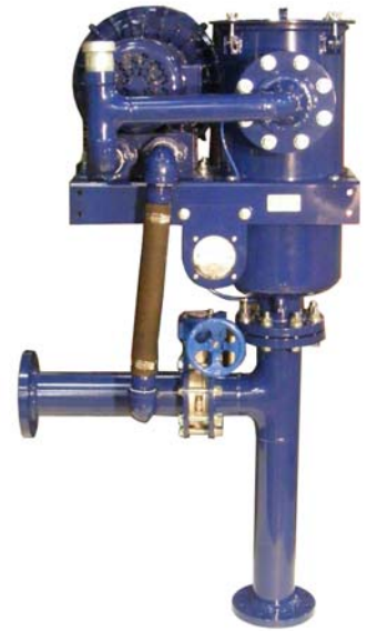
Stationary Diesel Engine Crankcase Ventilation System