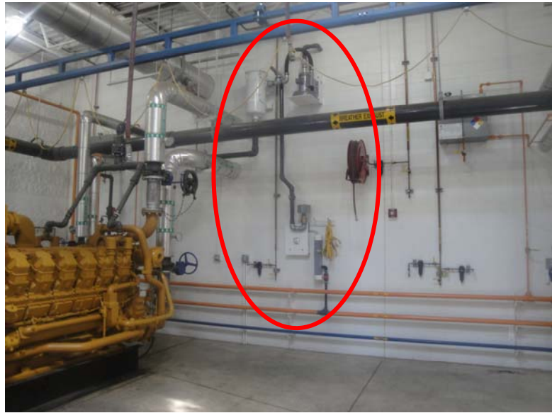
Landfill Gas to Energy Gen-Set Installation