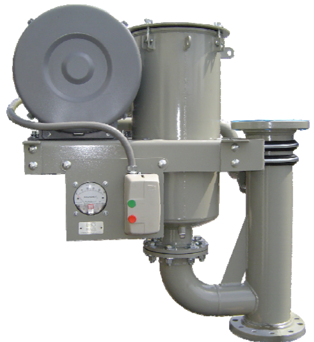
Marine Diesel Engine Crankcase Ventilation System