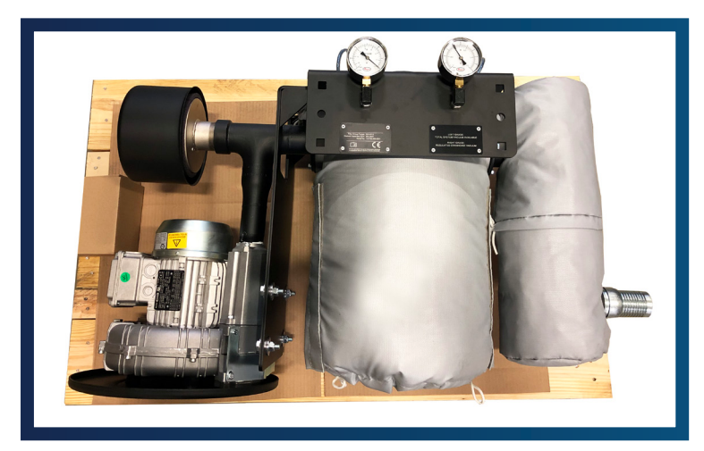
Insulation Jackets on Main Coalescing Filter and Pre-Separator on ACVB Series