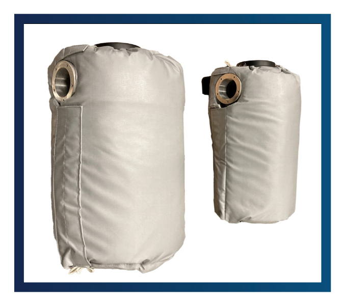
Insulation Jacket on ACV Series