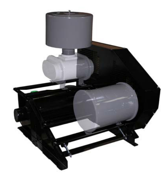
BBF Series frame shown with optional equipment.