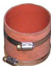
Boot kit (includes flexible boot and 2 clamps).